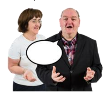
Independent advocacy and support

People getting Self-directed Support in South Lanarkshire said that having an advocacy worker is really helpful.